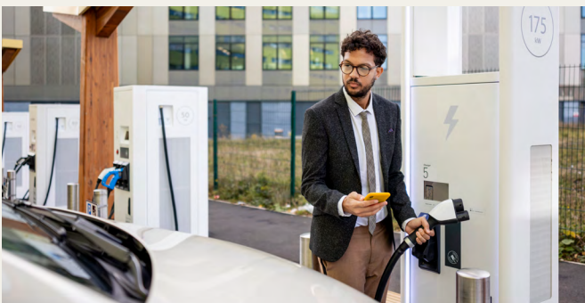
Public EV Charging Stations / EVSE