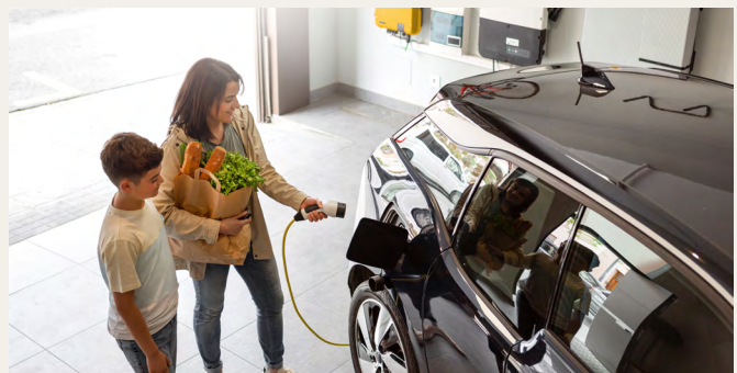
Residential EV Charging Stations / EVSE