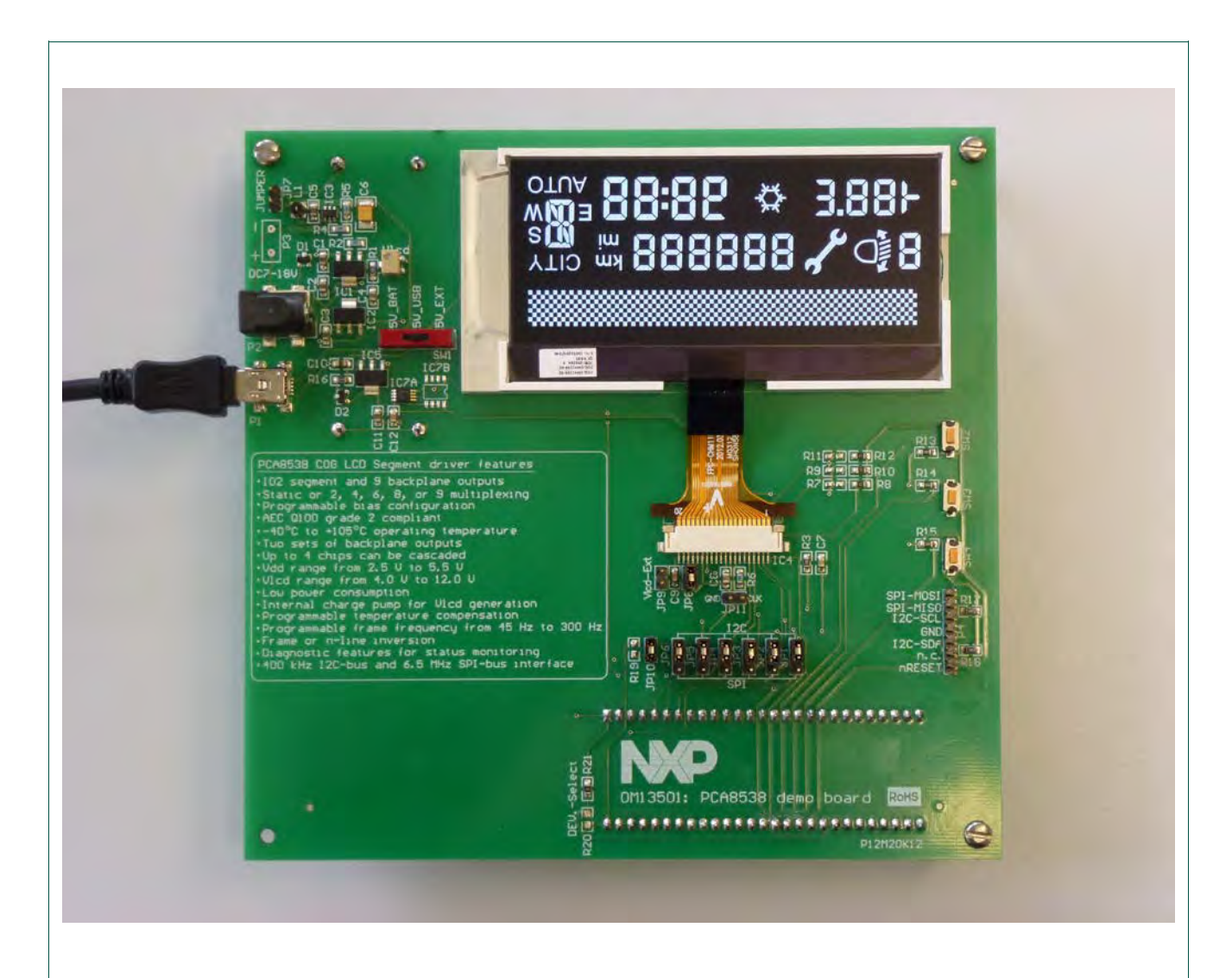
Fig 1. Top view of OM13501 demo board

In Fig 1 the top view of the board is given.