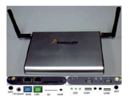
Figure 4 – Freescale nSEG reference platform

applications processor (ARM®926 based) that integrates a power management unit, a cryptography unit, and a rich set of connectivity controllers