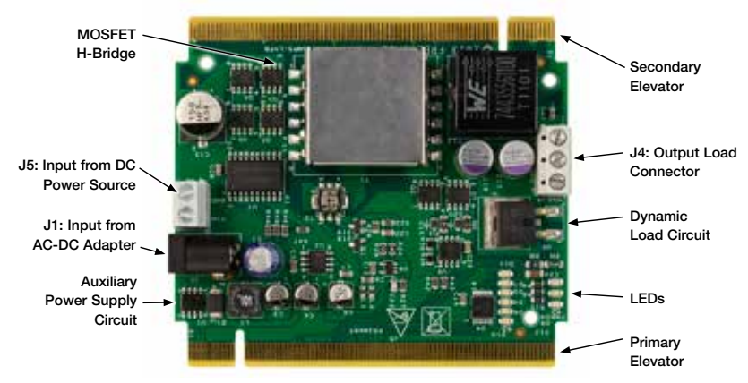
Figure 1: Front side of TWR-SMPS-LVFB