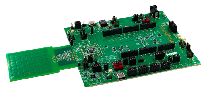
OM27642DB Development Board

To simplify design-in, the PN7642 is delivered either with a complete development kit with Arduino header (OM27642EVK) or a versatile, modular development board (OM27642DB). NXP's NFC Reader Library includes a complete, fully modifiable NFC protocol stack, and the development board's intuitive GUI, the NFC Cockpit, makes it easy to configure and adapt IC setting, without writing a single line of code. Available software examples include NFC card/device detection and simple data transfer, usage of host interfaces (SPI, I²C), command exchange with external MCU, and key provisioning.