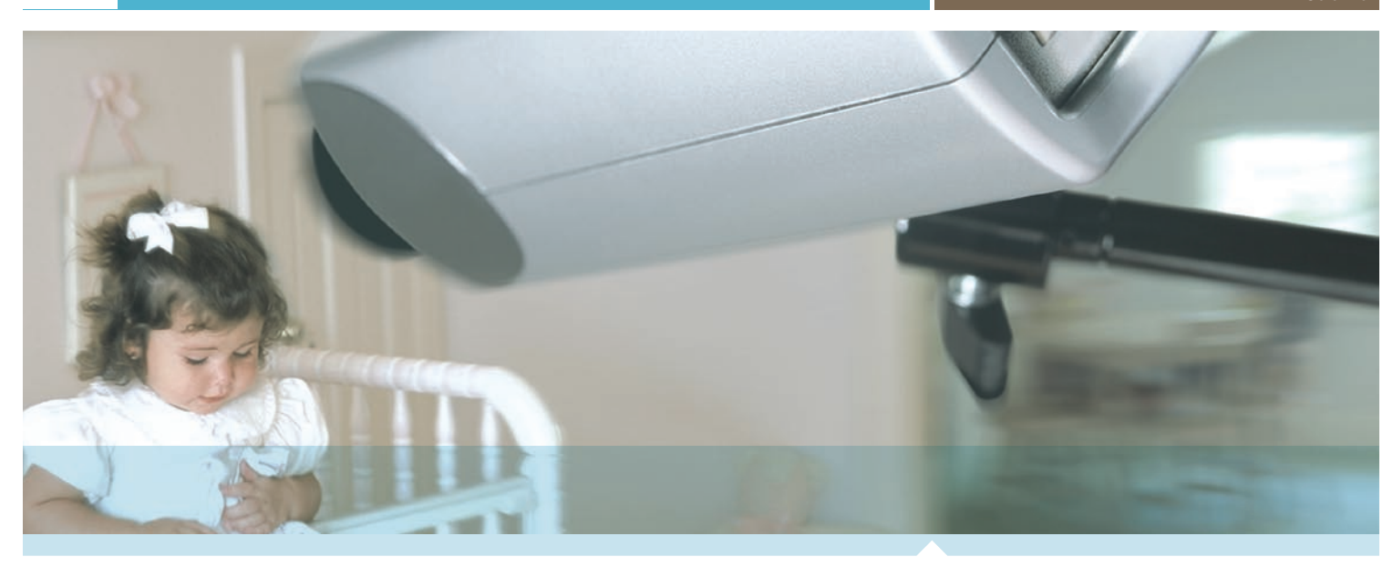
ColdFire® Embedded Controllers