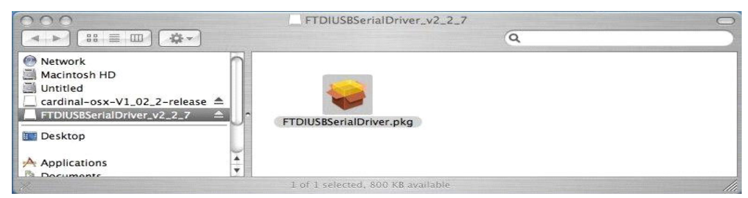
Figure 3. Running the FTDIUSB Installer

2. Double click on the FTDIUSBSerialDriver_v2_2_7.dmg and run the FTDIUSBSerialDriver.pkg by double clicking on the icon.