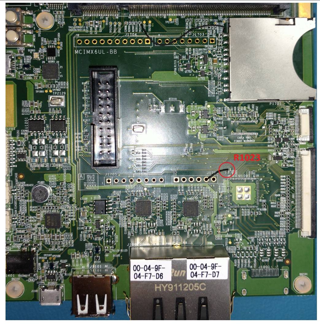
Figure 3. Connecting AUDIO MCLK to GPT CLK (Top Side)

i.MX6ULL EVK GenAVB/TSN Rework Application Note