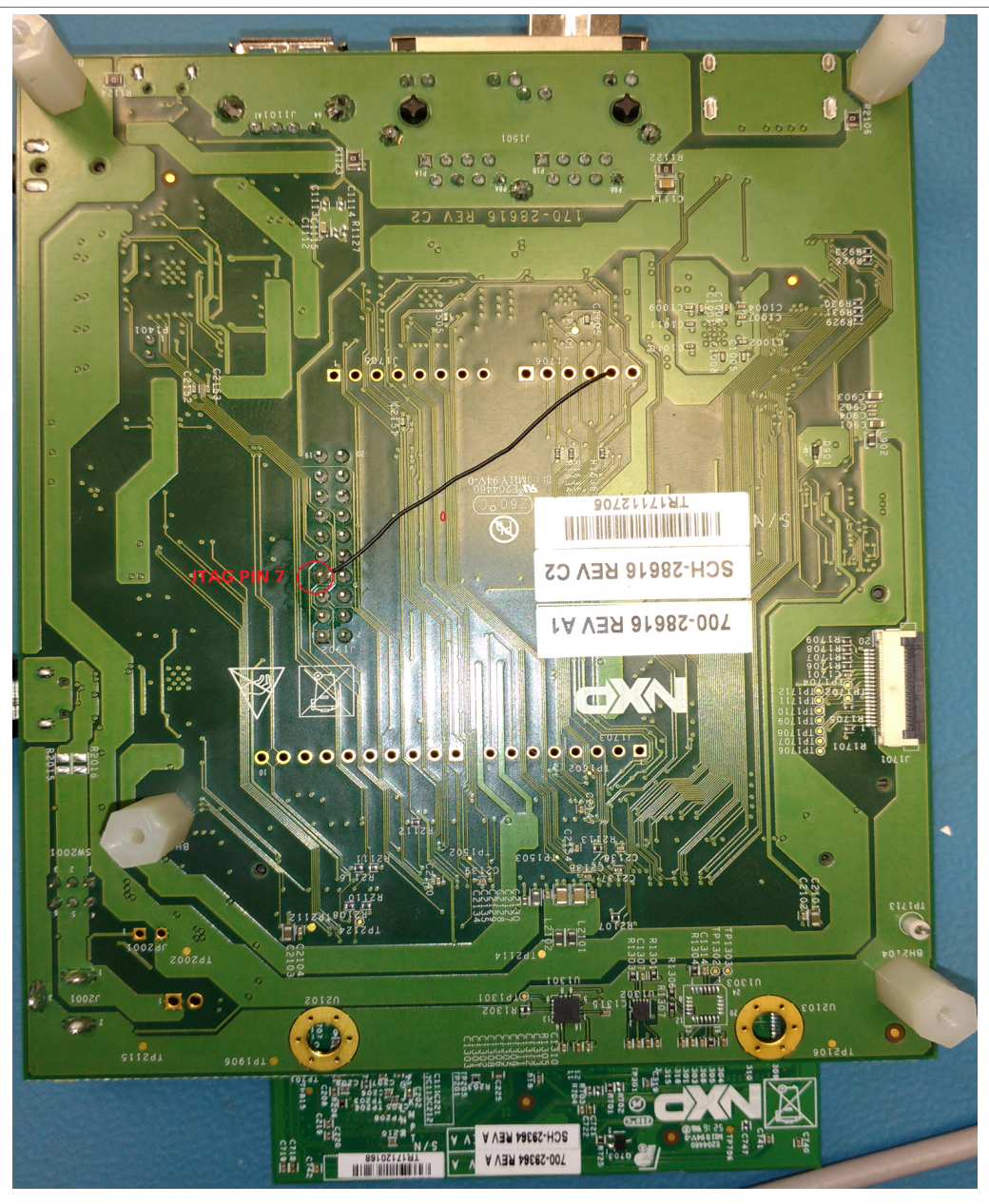
Figure 4. Connecting R1023 to JTAG Pin 7

i.MX6ULL EVK GenAVB/TSN Rework Application Note