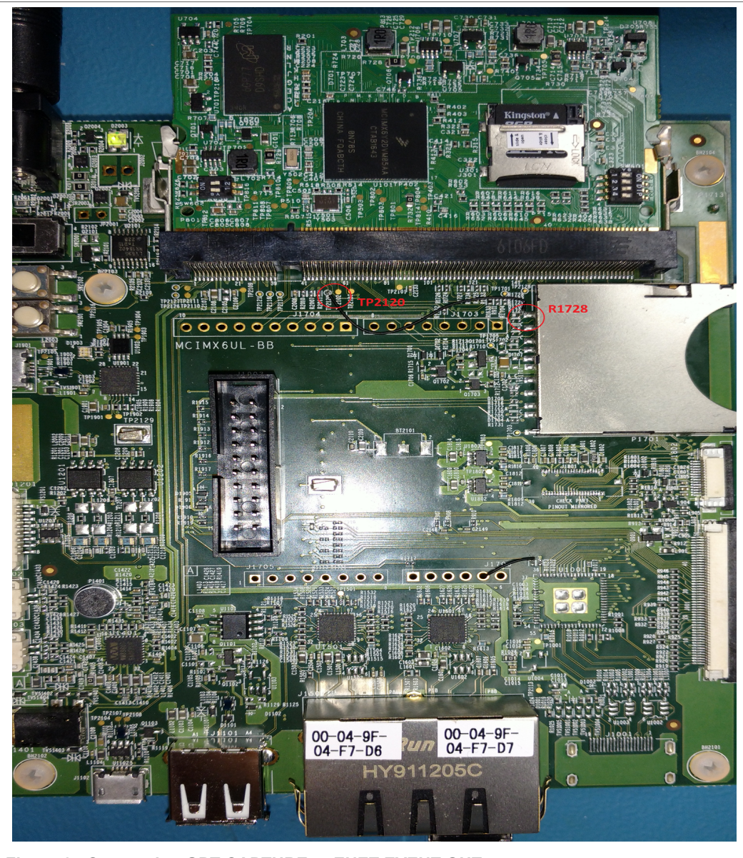
Figure 2. Connecting GPT CAPTURE to ENET EVENT OUT

i.MX6ULL EVK GenAVB/TSN Rework Application Note